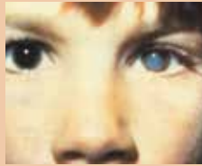
Pictured above: Ocular manifestation of the roundworm ( Toxocara canis ) in a young child with resulting vision loss.

Waukeag Veterinary Clinic considers parasites and zoonotic disease transmission a serious health concern. We want to provide our clients with the information and safeguards required to protect both you and your pet(s).