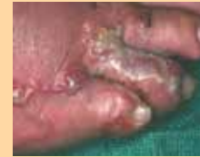
Hookworm effect on the skin

The veterinarians at Waukeag Veterinary Clinic recommend you implement a “Parasite Prevention Program.”