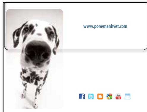
OPTIONAL - Print Envelope Back